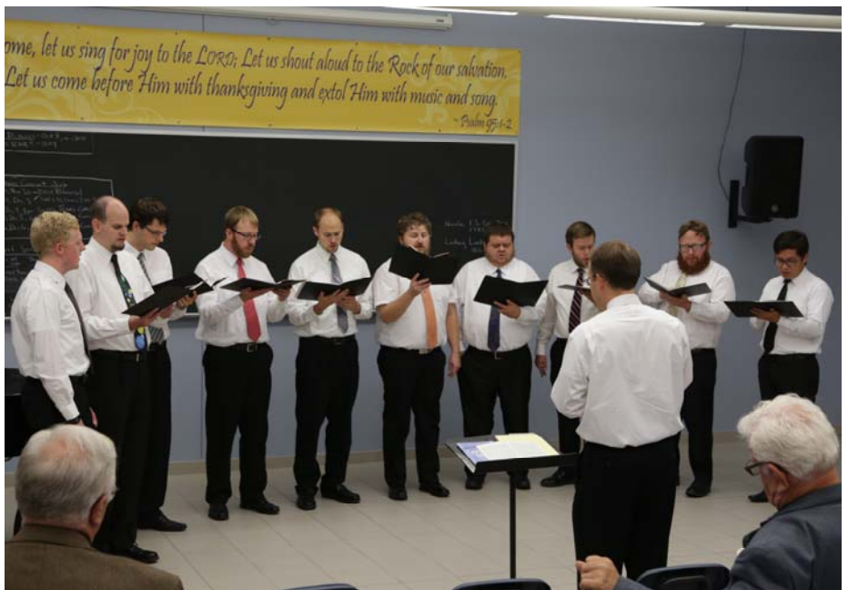
The Free Lutheran Seminary Chorus sings for the Annual Meeting.