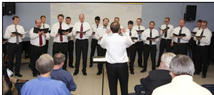
The AFLTS Seminary Chorus sings for the Annual Meeting.