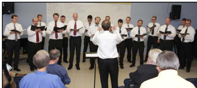
The AFLTS Seminary Chorus sings for the Annual Meeting.