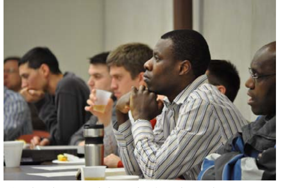
Seminarians participate in the Discussion Forum.