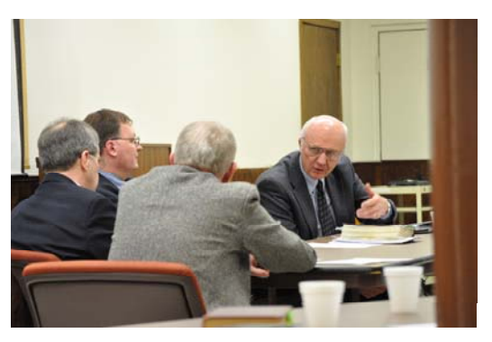
Panel discussion at January Discussion Forum at AFLTS.