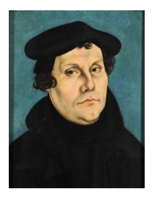
forgive sins, what then becomes of the Reformation's real principle that the righteous shall live by faith?

For if only a single class possessed the right to proclaim the Gospel and to dispense the sacraments, what had become of the formal principle of the Reformation, the unique authority of Scripture?...What profit would there be in placing the Bible in the hands of the congregation, if they did not have the authority to employ it? And if one particular class possessed a monopolistic right to