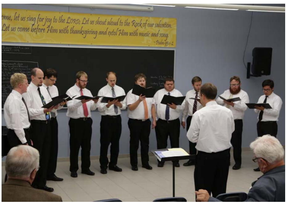
The Free Lutheran Seminary Chorus sings for the Annual Meeting.